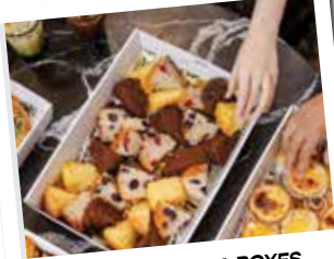
AFTERNOON TEA BOXES

USE CODE FIRST TO GET $10 OFF FIRST CATERING ORDER