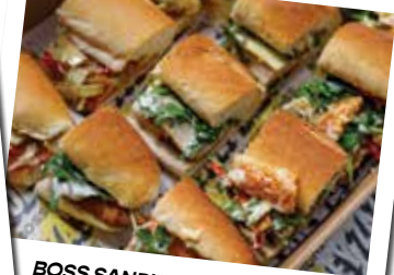
BOSS SANDWICH PLATTERS