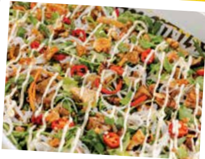
SALADS TO SHARE

Hit us up for boss catering by 1pm the day before for next day pick up or delivery. Order online at joeyzazas.com.au/catering or email catering@joeyzazas.com.au for more info