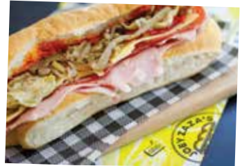
THE CLASSIC CONTI

“It’s hard not to imagine you’re in New York as you bite into the mouth-watering Porchetta Pleaza...or even a classic Conti done the Joey Zaza’s way...Sitting pretty on St Georges Terrace, it shouldn’t come as a surprise that these guys do some of the best catering in town. Whether you’re after huge platters filled with tasty sangas or you want to order every sandwich or salad individually, they’ll help you out. Just be sure to add some brownies, cookies or muffins to your order, you won’t regret it.”