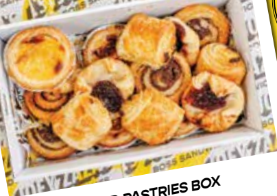
MIXED PASTRIES BOX