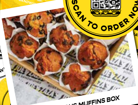
SCRUMPTIOUS MUFFINS BOX