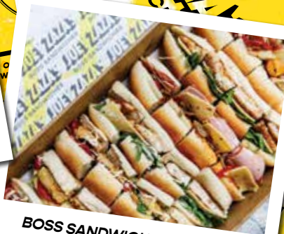
BOSS SANDWICH PLATTERS