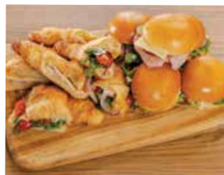
BREKKIE SLIDERS & CROISSANTS

Cream cheese, mushroom, red onion, spinach, cherry tomatoes, basil pesto topped with feta