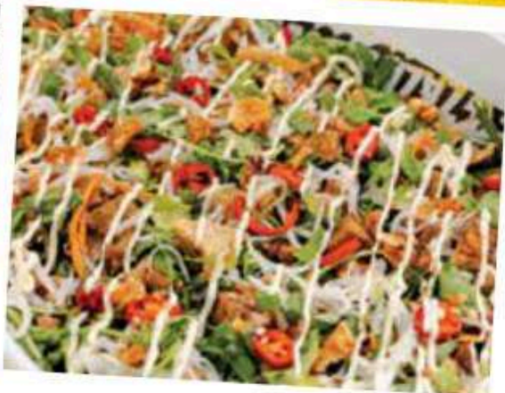
SALADS TO SHARE

Hit us up for boss catering by 1pm the day before for next day pick up or delivery. Order online at joeyzazas.com.au/catering or email catering@joeyzazas.com.au for more info