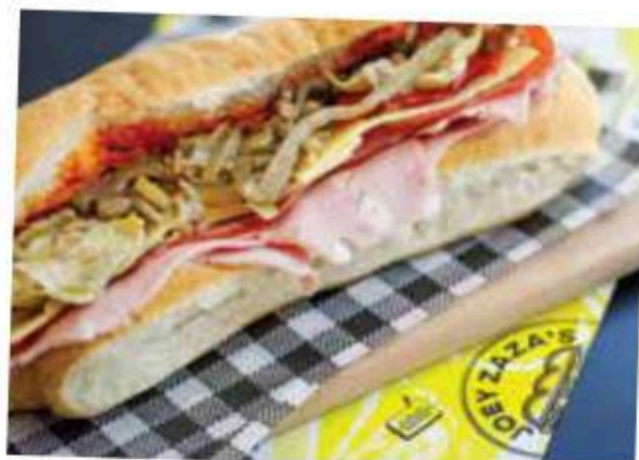
THE CLASSIC CONTI