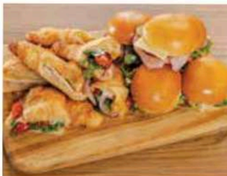
BREKKIE SLIDERS & CROISSANTS

Cream cheese, mushroom, red onion, spinach, cherry tomatoes, basil pesto topped with feta