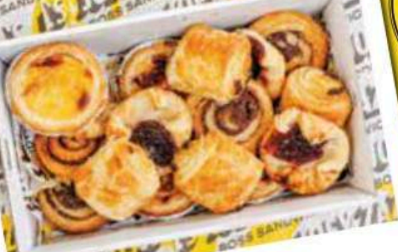
MIXED PASTRIES BOX