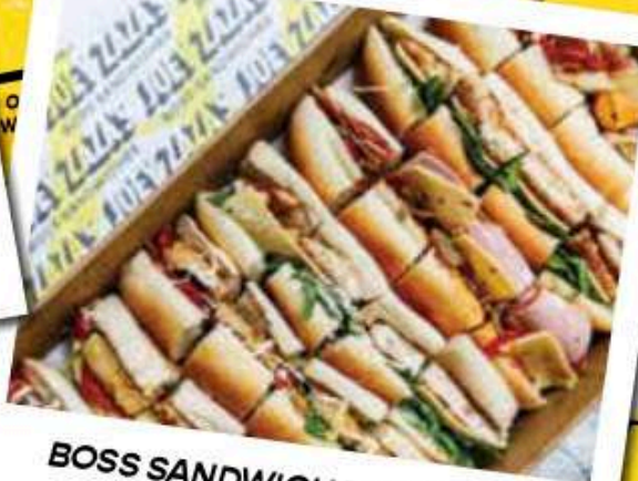
BOSS SANDWICH PLATTERS