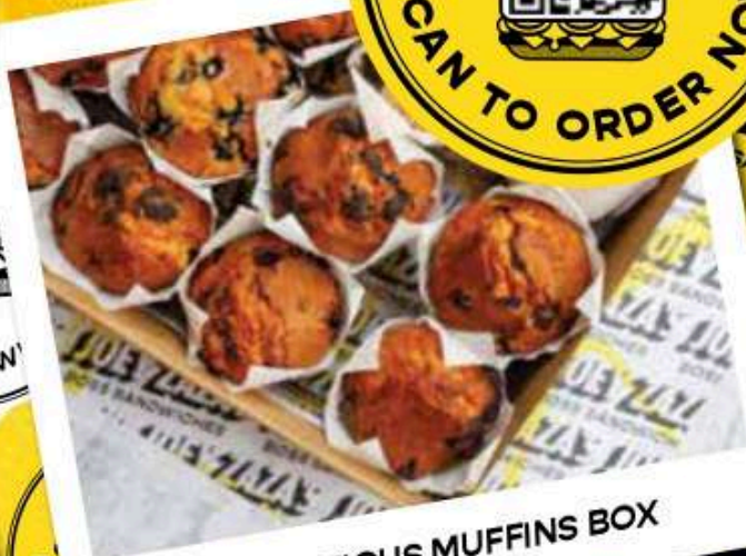
SCRUMPTIOUS MUFFINS BOX