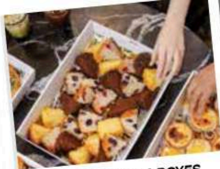
AFTERNOON TEA BOXES

USE CODE FIRST TO GET $10 OFF FIRST CATERING ORDER