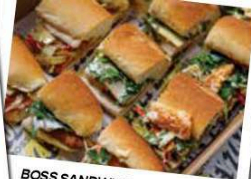
BOSS SANDWICH PLATTERS