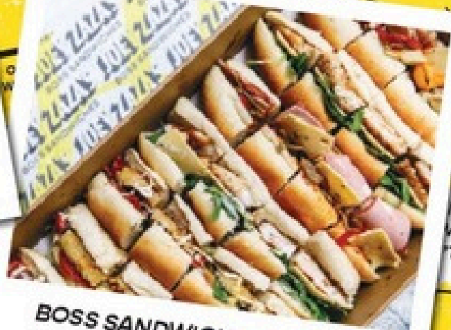
BOSS SANDWICH PLATTERS