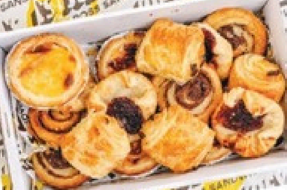
MIXED PASTRIES BOX