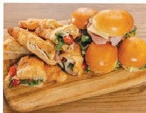
BREKKIE SLIDERS & CROISSANTS

Cream cheese, mushroom, red onion, spinach, cherry tomatoes, basil pesto topped with feta