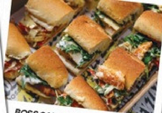
BOSS SANDWICH PLATTERS