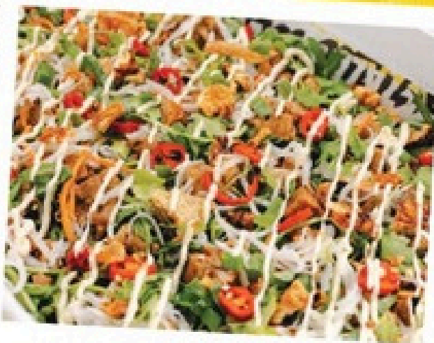
SALADS TO SHARE

Hit us up for boss catering by 1pm the day before for next day pick up or delivery. Order online at joeyzazas.com.au/catering or email catering@joeyzazas.com.au for more info