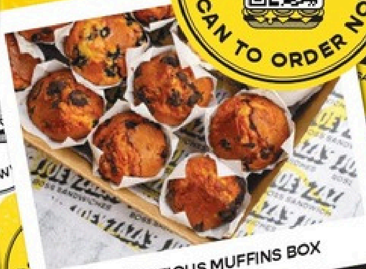
SCRUMPTIOUS MUFFINS BOX