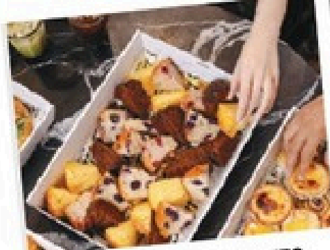
AFTERNOON TEA BOXES

USE CODE FIRST TO GET $10 OFF FIRST CATERING ORDER